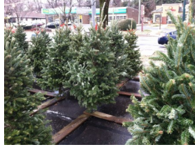
When the lot opened on Dec. 17, only a few stalwart small trees remained for sale.

Thanks to all who participated in this effort that raised over $32,000 for our Youth Fund and the kids in the greater Vienna area. While we had help from the Madison baseball team, the Oakton football team, the Marshall and Madison Octagon Clubs and the JOOI Club at Louise Archer Elementary, it was the club members who provided the guidance and sweat equity that made for another successful sales season.