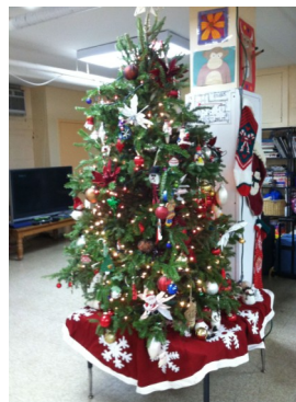
Above: A tree from our lot is beautifully decked out by the kids at the Culmore Teen Center.

Since the summer of 2014 our Fourth Wednesday program has provided dinner and birthday treats once a month to the Teen Center. When appropriate, our volunteers also stay to serve the meal, help kids with homework, play games—generally just “go with the flow” of what is happening at the Center.